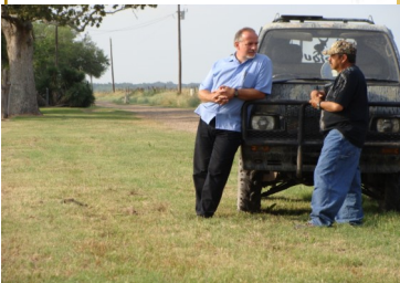
Planting the seed!!!!