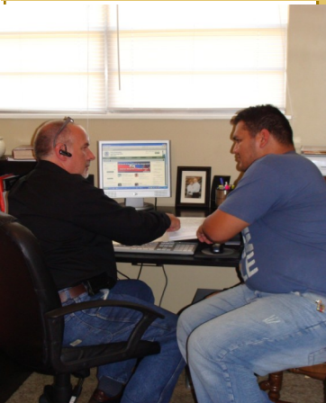
Watering the seed!!!!